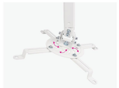
Adjustable Support Arms for projectors of different sizes.