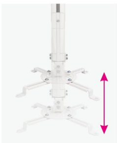
Adjustable Length for your different choices.