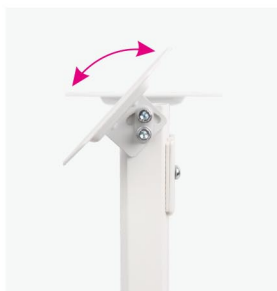
Ceiling Plate can be Adjusted for using with flat or pitched ceiling.